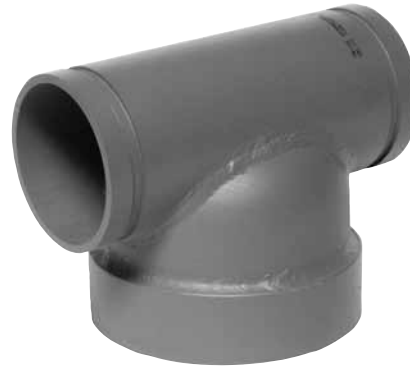
FIGURE 7062 BULLHEAD TEE (GR x GR x FPT)