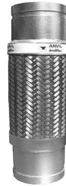
Groove x Groove Proper Installation

2 During system shutdown braided metal hose assembly should be examined to verify no thermal axial motion has occurred causing compression of the assembly.