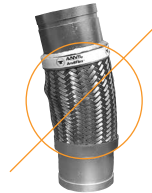
Groove x Groove Improper Installation Parallel