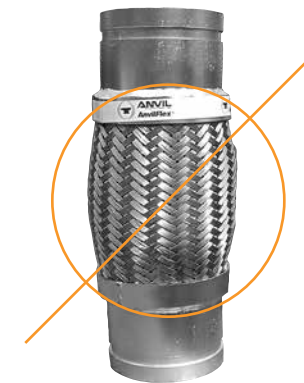
Groove x Groove Improper Installation Compressed