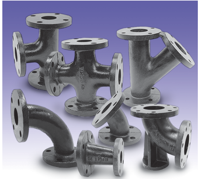
Cast Iron Flanged Fittings and Cast Iron Flanges

An inspection limit of plus or minus 1/32 inch (1mm) shall be allowed on all center to contact surface dimensions for sizes up to and including 10 NPS (250 DN); plus or minus 1/16 inch (1.5mm) on sizes larger than 10 NPS (250 DN). Inspection limit of plus or minus 1/16 inch (1.5mm) shall be allowed on all contact surface to contact surface dimensions for sizes up to and including 10 NPS (250 DN); plus or minus 1/8 inch (3mm) on sizes larger than 10 NPS (250 DN). The largest opening in the fitting governs the tolerance to be applied to all openings.