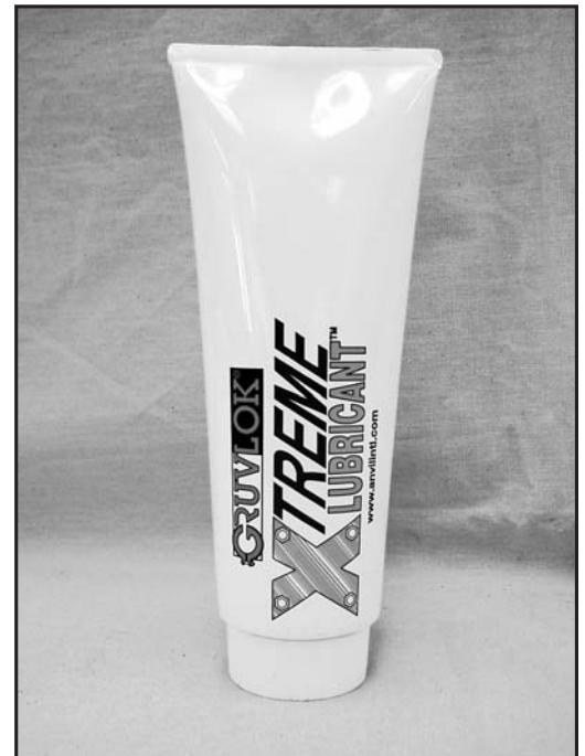
Gruvlok ® Xtreme Lubricant ™ is an excellent choice for applications above 180° F and below -20° F.

No-lube gaskets are great tools for the right application. They do require more care during application and installation. If you have questions about whether no-lube gaskets are appropriate for your situation, remember the three main criteria to help you make the final choice: pipe condition, grooving accuracy, and temperature.